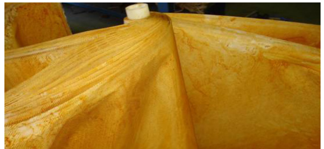
Removes Iron Deposits